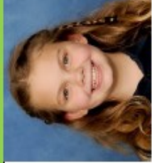
India Secondis Female Vice-Captain